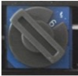
VEHICLE SELECT SET FOR 6