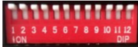
COMMUNICATION SWITCHES ALL UP

Place vehicle option switches in the correct position before plugging module into Lockpick harness. If you desire to change a setting, unplug module first.