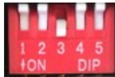
OPTION SWITCHES PLACE 3 DOWN